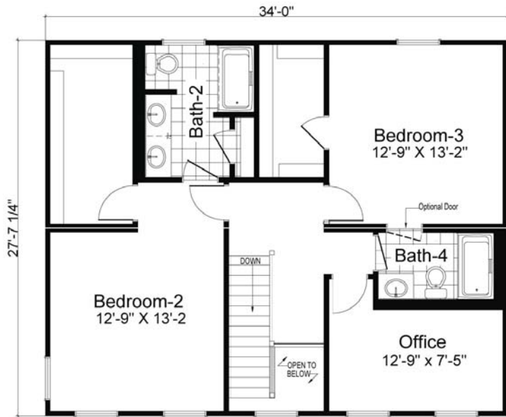
Alt. #1 Second Level